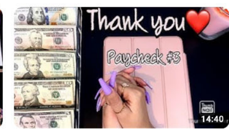
January 2021 | Cash envelope stuffing | paycheck # 3 | Budget