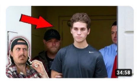
This frat boy did the unthinkable (*MATURE AUDIENCES ONLY*)