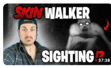
The most BELIEVABLE alien encounter | The Skinwalker Ranch story