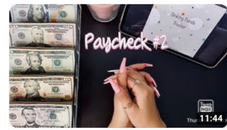
January 2021 | Cash envelope stuffing | Paycheck 2 | Budget