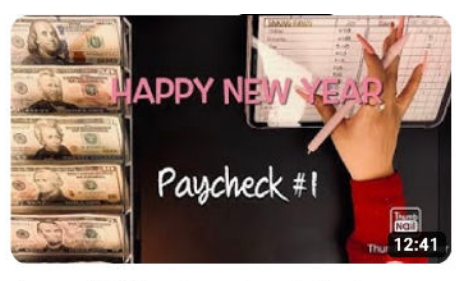
January 2021 | cash envelope stuffing | paycheck # 1 | budget