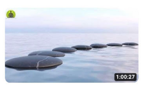
"Instant Relief From Anxiety & Stress" Peaceful Meditation Music, Deep Relaxing ...