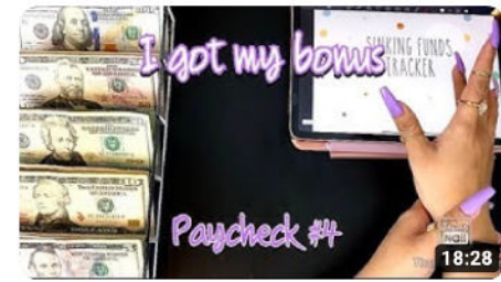
January 2021 | Cash envelope stuffing | Paycheck #4 | Budget