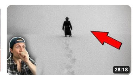
Top 3 SCARIEST stalkers in the wild | Missing 411 (Part 17)

This psycho inspired "Scream" (*MATURE AUDIENCES ONLY*) 9.1M views * 1 year ago