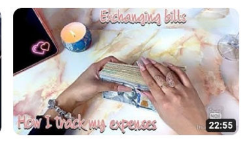
Sinking funds update #6 | cash envelope unstuffing | how I track my expenses |...