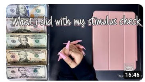
Stimulus check | JANUARY 2021| cash envelope stuffing | budget