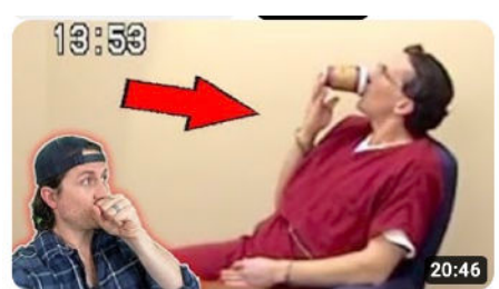
This man terrified the FBI (*MATURE AUDIENCES ONLY*)