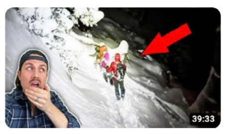
This trail is a death trap 9.2M views • 1 year ago

This psycho inspired "Scream" (*MATURE AUDIENCES ONLY*) 9.1M views * 1 year ago