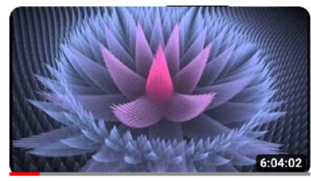
432 Hz - Deep Healing Music for The Body & Soul - DNA Repair, Relaxation Music,...