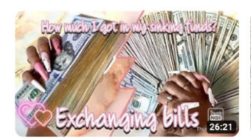
SINKING FUNDS UPDATE #5 | cash envelope un-stuffing | Pinkxbudgetz